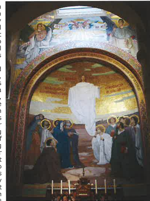
Rosary Basilica, Lourdes, 19th century

Our hope as Christians is a living hope which allows us to rejoice even in the difficult times of our lives. As Pope Francis says, at Easter "the destiny of the world was changed; the proclamation that Christ is 'truly risen' is a reminder that our hope is not an illusion, but the truth".