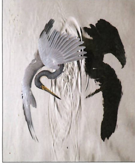
Tricoloured heron

But not gone. An angel tells the disciples to cease from looking up because, mystery of mysteries, Christ returns in his Holy Spirit present in the muck of life and all its ambiguity and pain. It is here where we must seek Him: in His Word proclaimed in the Scriptures, in His Body and Blood in the Eucharist, in the community of believers who form his mystical body on earth ... and in the poor, the hungry, the sick, the homeless, for whom, he says, if we serve them, "you do it to me."