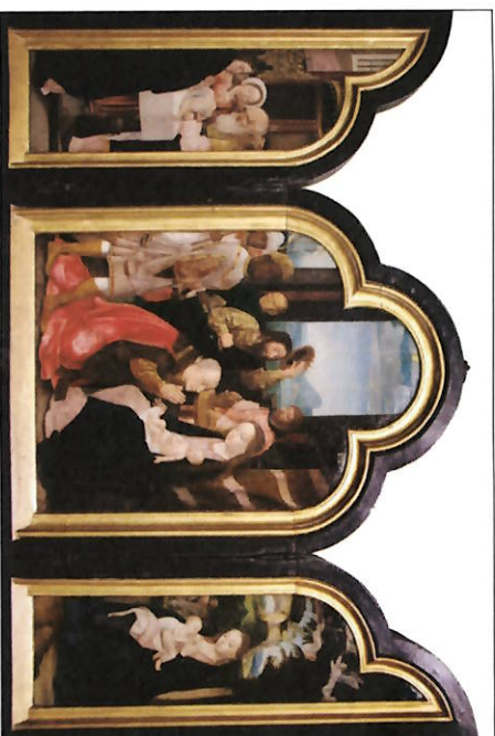
Triptych of the Nativity, St Jean, Bingeres

Epiphany of the Lord • Year A Divine Office: Week 1 • 8 January 2023